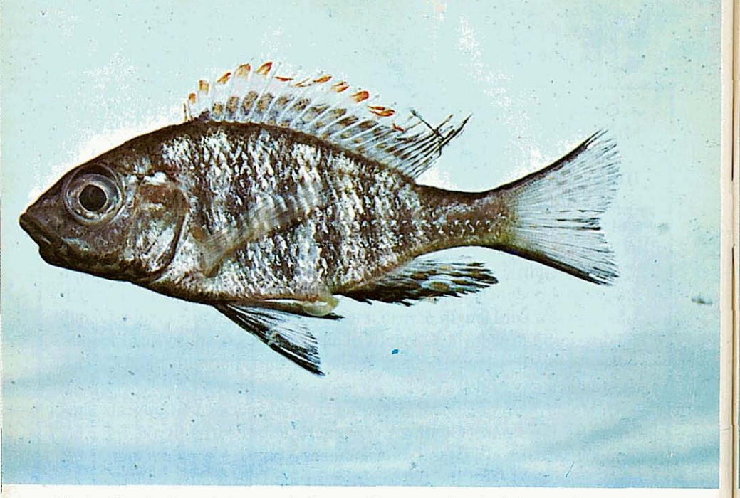
Fig. 5. Haplochromis hennydaviesae. New species, holotype. LS Phis my H. ganniculus? Related?

Holotype.—160 mm standard length. Dorsal fin XVI,12; anal fin