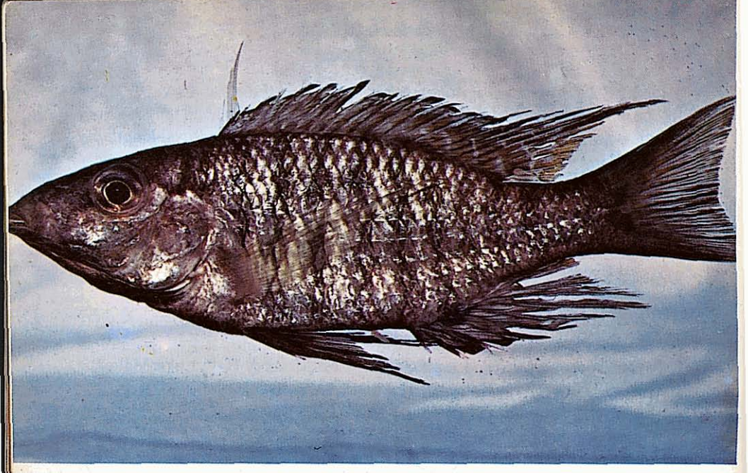
Fig. 3. Lethrinops polli. New species, holotype.

Body depth contained 2.7 times, head length 2.6, predorsal length 2.6, depth of caudal peduncle 9.0, pectoral fin length 2.7 pelvic fin length 3.5, all in standard length. Eye diameter contained 2.7 times, snout length 3.0, interorbital width 4.5, length of upper jaw 3.1, all in head length.