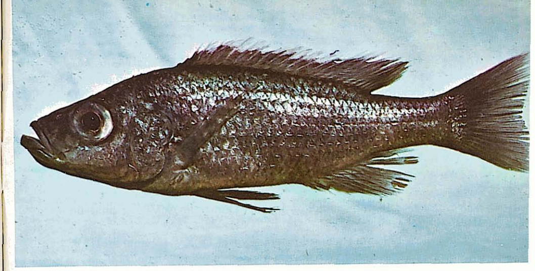
Fig. 2. Diplotaxodon ecclesi. New species, holotype.

1935; Fryer and Iles, 1972), but D. ecclesi is bronzy with black pelvic fins and a white edge to the dorsal fin.