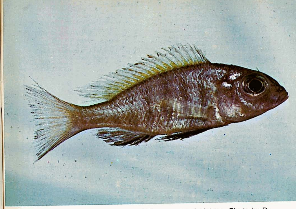
Fig. 6. Haplochromis stonemani. New species, holotype.