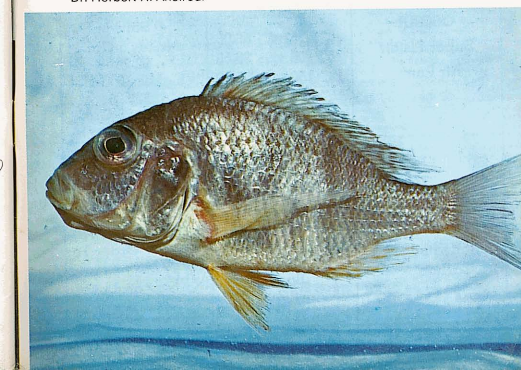
Fig. 4b. Lethrinops gossei, female. New species, paratype.