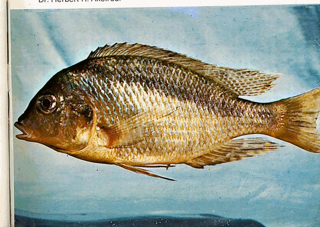
Fig. 7. Haplochromis anaphyrmus. New species, holotype.