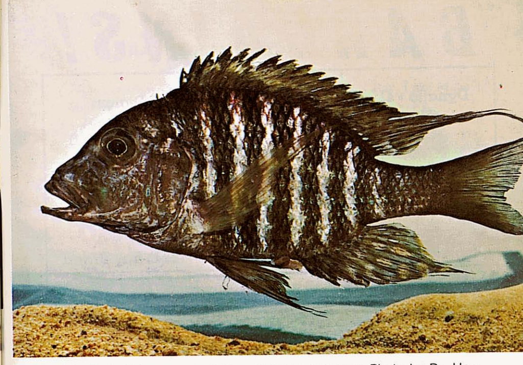
Fig. 4a. Lethrinops gossei. New species, holotype.

Fig. 4b. Lethrinops gossei, female. New species, paratype.